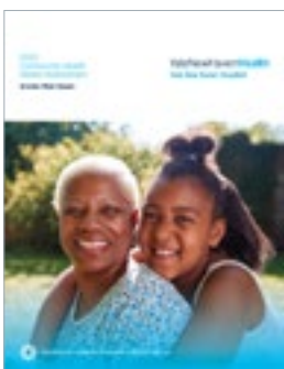
Yale New Haven Health published the results of its Community Health Needs Assessment, which is available on the health system's website.

As a community-based, not-for-profit healthcare organization, Yale New Haven Health is devoted to serving neighborhoods and those most in need and filling the gaps in healthcare services. Yale New Haven Health and its community partners released the results of its Community Health Needs Assessment (CHNA), which is conducted every three years. The CHNA was a community-wide undertaking with extensive data collection and input from community residents, health providers and social services experts. The results are used to develop programs and services that target the specific, unique needs of our communities.