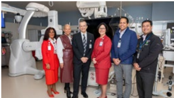
The addition of a single-plane angiography unit at Yale New Haven Hospital's Saint Raphael Campus, is used for complex interventional radiology procedures, often reducing the need for traditional surgery.

Longtime smokers at increased risk of developing lung cancer now have access to an innovative screening at Greenwich Hospital through the Lung Cancer Screening Program at Smilow Cancer Hospital-Greenwich using low-dose CT scans that could significantly increase five-year survival rates. A computerized tomography (CT) scan combines a series of X-ray images taken from different angles around the body to create cross-sectional images that provide more-detailed information than a traditional X-ray. In one clinical trial, high-risk patients who had a low-dose CT scan saw a 20 percent reduction in mortality compared to those who had a chest X-ray.