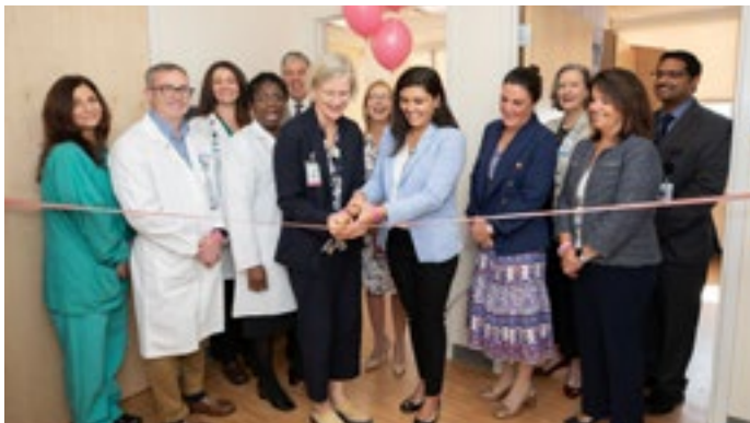
At Bridgeport Hospital, the opening of the Hispanic Breast Cancer Program through Smilow Cancer Hospital broke new ground while breaking down communication and cultural barriers to better meet the needs of a growing Hispanic population.

The health system also extended access to digestive health services through the Digestive Health Center in Westbrook. The center offers specialty care for colorectal, hernia, fatty liver disease and foregut issues, along with weight-loss services. The location includes a Center for Weight Management, which brings together experts in medical and surgical weight-loss, endocrinology, behavioral health, nutrition and exercise physiology.