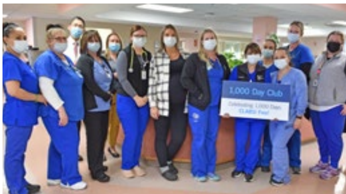
The prevention of central line-associated bloodstream infections (CLABSIs) is essential to improve patient safety and reduce healthcare costs. Unit 5.2 at Lawrence + Memorial Hospital joined the health system’s “1,000 Day Club” for units that achieve 1,000 days without CLABSI by adhering to stringent protocols to minimize the risk of infection.

Yale New Haven Hospital continued to rank among the top hospitals in the country, according to U.S. News & World Report’s annual “America’s Best Hospitals” listing. Of the nearly 5,000 hospitals surveyed, Yale New Haven Hospital ranked nationally in 8 of 16 specialties. In addition to being ranked #4 nationally in Obstetrics and Gynecology, Yale New Haven Hospital scored well in Pulmonology and Lung Surgery (#25), Geriatrics (#26), Otolaryngology (Ear Nose and Throat) (#38), Gastroenterology and GI Surgery (#42), Urology (#41), Diabetes and Endocrinology (#45) and Cancer (#50). The hospital also made the U.S. News “America’s Best Hospitals” listing each of the past 32 years.