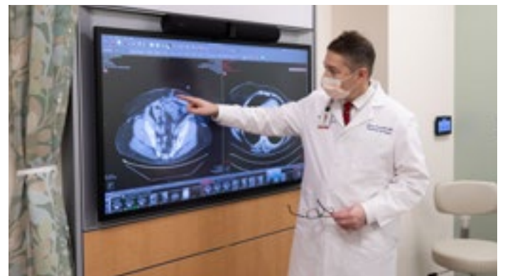
The North Haven Medical Center welcomed additional services such as the Center for Digestive Health. Digestive Health specialists provide medical, surgical and other treatments for a wide variety of conditions.