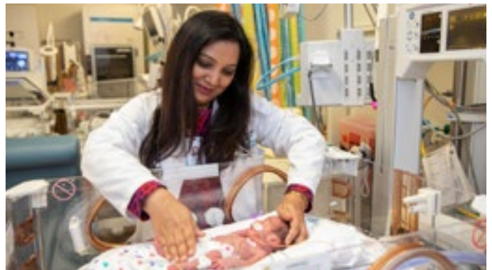
Opening the Pediatric Ambulatory Surgery Center at Greenwich Hospital brought children and families access to advanced pediatric surgical expertise for leading specialists from Yale New Haven Children's Hospital and Yale School of Medicine.