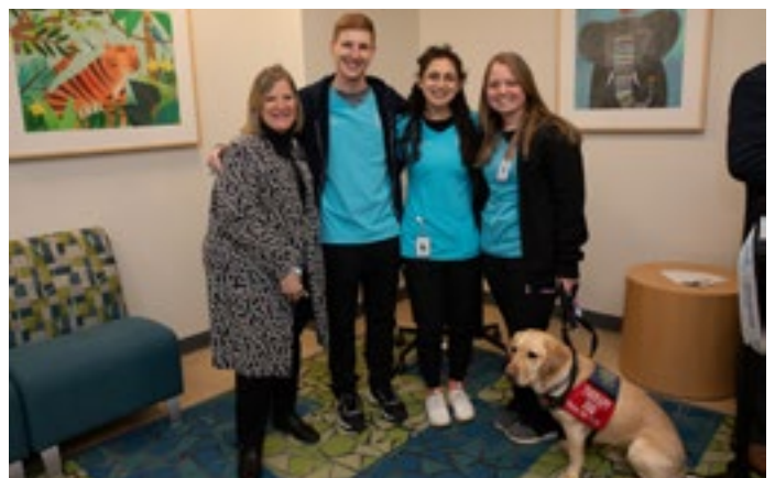
Children now have access to the Day Hospital, an intensive outpatient program that offers specialized treatment for a range of mental health issues and symptoms such as depression, anxiety, self-destructive patterns, intrusive thoughts, interpersonal relationships, trauma, loss, gender identity, emotional/behavioral dysregulation and school avoidance.