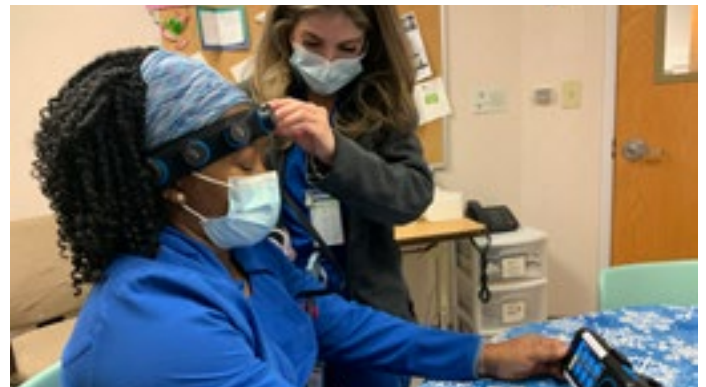
Rapid, accurate point-of-care EEG data at the bedside was made available at Lawrence + Memorial Hospital through the Ceribell EEG Rapid Response system, which offers 24/7 detection and monitoring of seizures in the intensive care unit.

Yale New Haven Children's Hospital partnered with American Medical Response (AMR), to purchase two new state-of-the-art ambulances for the pediatric and neonatal critical care teams. The ambulances are outfitted with advanced technology and equipment to stabilize, treat and transport pediatric patients. The teams are trained and equipped to provide full ICU capabilities, monitoring, and advanced airway and ventilation management during transport of children across the state and Northeast.