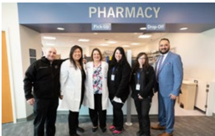
Committed to bringing services to patients where they live and work, Yale New Haven Health Pharmacy opened a pharmacy at the North Haven Medical Center. The pharmacy offers a number of services including prescriptions and over-the-counter medications, vaccinations, consultations and help enrolling in copay assistance programs.

In 2023, Yale New Haven Health established the aligned clinician enterprise between Yale Medicine and Northeast Medical Group which allows the health system, in partnership with Yale School of Medicine, to deliver a coordinated strategy for quality, service and access.