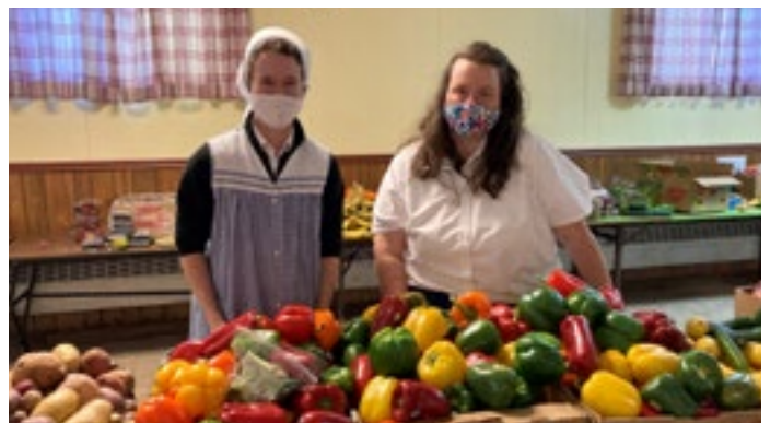
Apostle Immigrant Services was among the local agencies that received donations from Yale New Haven Health employees via the GiveHealthy food drive.