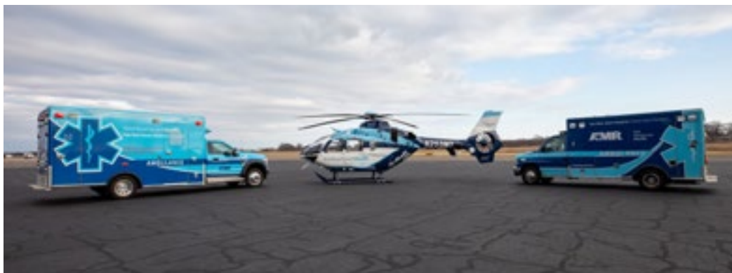
Critical care transport was enhanced through two new ambulances specifically for the pediatric and neonatal critical care teams and the welcome addition of the health system's second SkyHealth critical care transport helicopter.

Yale New Haven Children's Hospital was recognized for patient safety by Solutions for Patient Safety for its exemplary culture of safety. The award recognizes units that meet their discharge target the most days in the previous month. It is part of Yale New Haven Health's efforts to improve patient throughput by ensuring that patients who are clinically ready to leave the acute-care setting experience a safe and timely discharge.