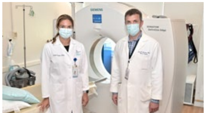
The Lung Cancer Screening Program at the Smilow Cancer Hospital Care Center in Greenwich includes pulmonologists, chest radiologists, thoracic surgeons, thoracic oncologists, smoking cessation specialists and nurse practitioners.