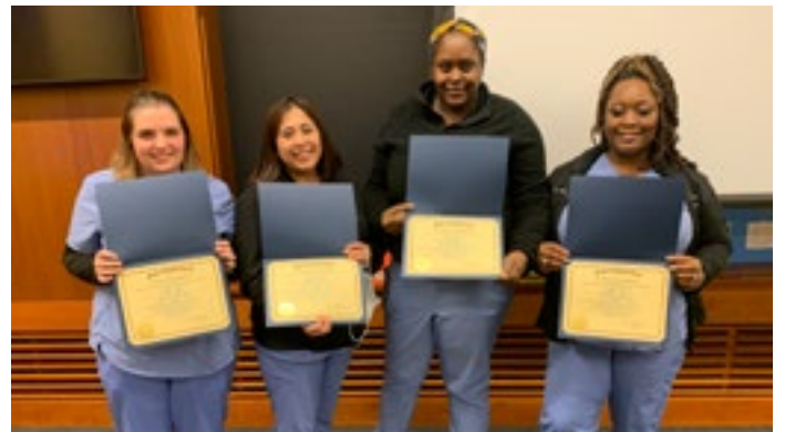
The first class of Yale New Haven Health's Patient Care Associate/ Patient Care Technician (PCA/PCT) Registered Apprenticeship Program graduated 100 apprentices.