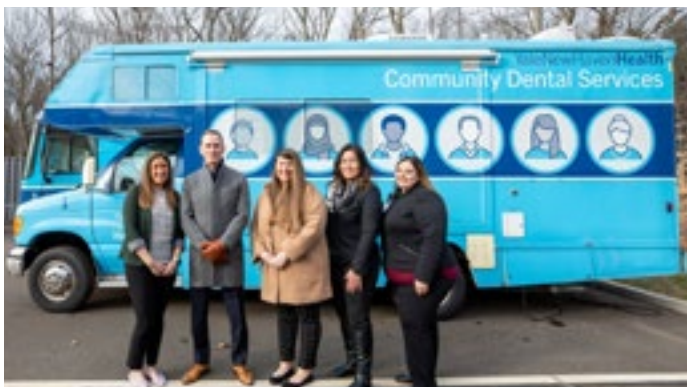
Yale New Haven Hospital's Pediatric Dental Program hit the road to provide dental treatments to children throughout the community.

As part of its efforts to prevent firearm-related injuries, Yale New Haven Health joined a nationwide Hospitals United public awareness and education campaign around firearm safety. The campaign encouraged parents to ask family and friends if firearms are safely stored in their homes. The campaign used broadcast, print and digital public service messages to empower parents and families to ask others about access to guns. The campaign reminded people that unlocked guns can lead to death, suicide and gun violence.