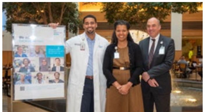
Recognizing that world-class care rests on ensuring that everyone has a fair and just opportunity to be as healthy as possible, regardless of race or ethnicity, Yale New Haven Health launched the We Ask Because We Care campaign, a multi-phased initiative to improve the equity, quality and safety of patient care.