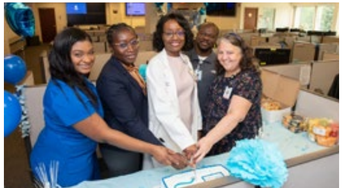
Celebrating the first anniversary of the Home Hospital program, staff achieved a milestone in providing acute, inpatient-level care to more than 450 patients in the comfort of their own homes. Studies show home hospital programs reduce risk of hospital readmissions and improve patient satisfaction.