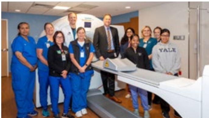
The addition of a positron emission tomography (PET) scan system allowed staff see more patients in need of the imaging test that can help reveal the metabolic or biochemical function of tissues and organs.

Access also ties into patient throughput, moving patients through the appropriate levels of care in their recovery. The Home Hospital program, in its second year, provides acute, inpatient-level care in the patient's home with physician oversight, in-person nurse visits and telehealth monitoring. The program has earned high patient satisfaction scores and has contributed to improving inpatient throughput by opening much-needed beds during periods of high inpatient census and increased emergency department volume.